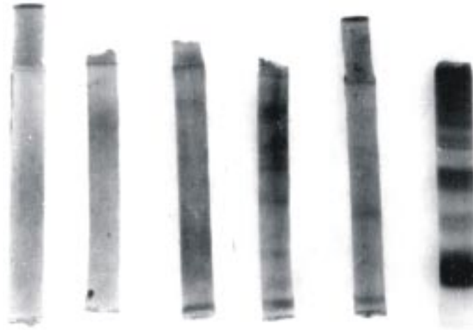
Fig. 2 : Photo representation of electrophoretic protein of eye protein in retina of different vertebrates serially. 1. Rohu, 2. Toad, 3. Calotes, 4. bird, 5. Goat, 6. Standard human serum.